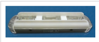
FlareShield™ on module